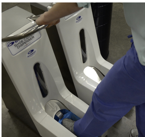
Coloque un pie en el dispensador, primero el talón.

Dispensar las cubiertas de zapatos ahora es tan simple como 1 - 2 - 3: