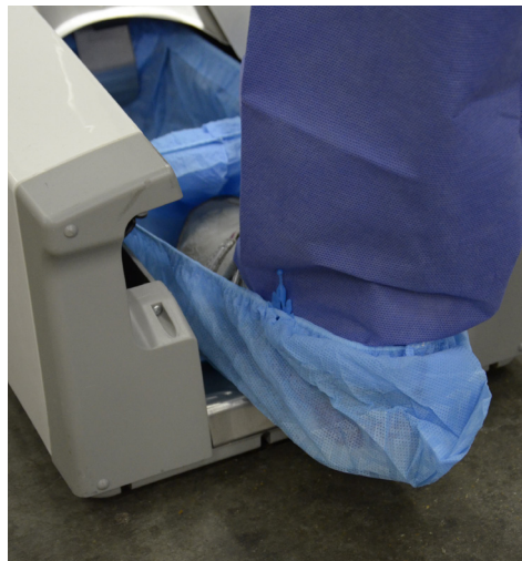
Slowly pull back until cover stretches beyond shoe tip, point toe down and pull back.