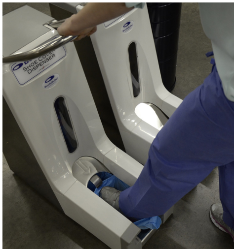
Place one foot in the dispenser, heel first.

Dispensing shoe covers is now as simple as 1 - 2 - 3: