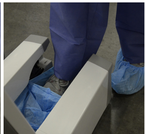
Repita con el otro pie.