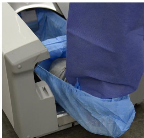
Lentamente tire hacia atrás hasta que la cubierta se extienda más allá de la punta del zapato, apunte hacia abajo y tire hacia atrás.