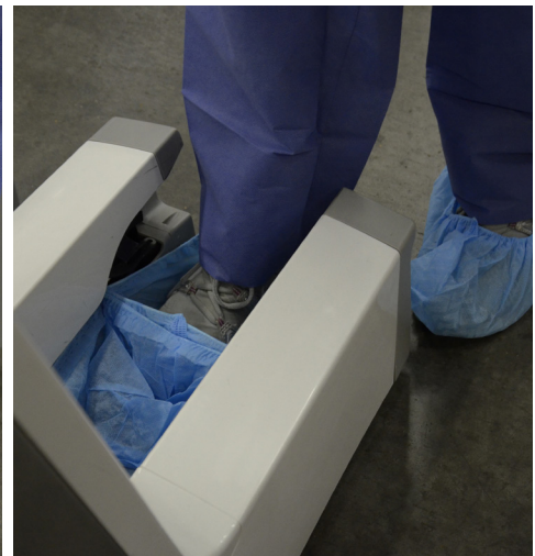
Repeat with other foot.

Dispensar las cubiertas de zapatos ahora es tan simple como 1 - 2 - 3: